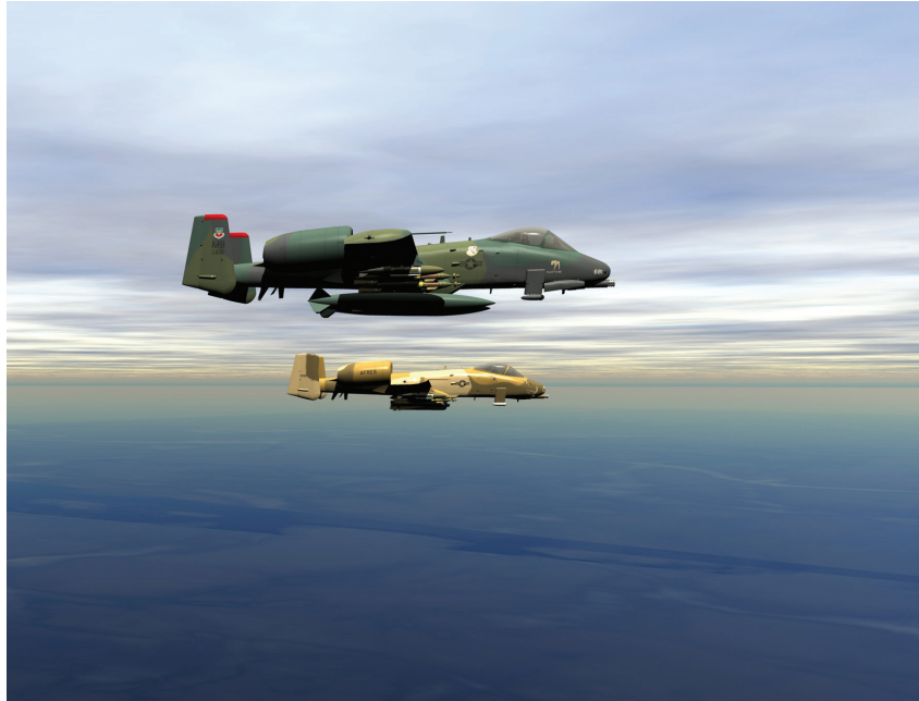
Image 1. A10 Patrol