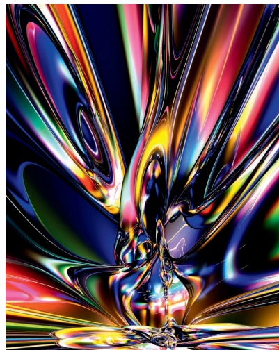
Image 3. Abstract No. 130