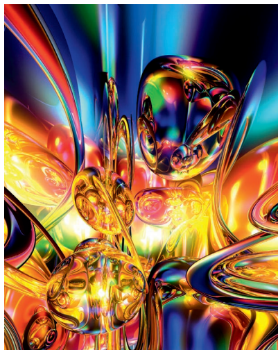
Image 2. Abstract No. 90