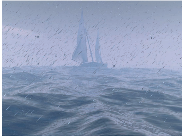
Image 2. Sailing in the Rain