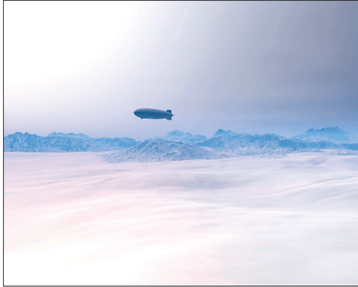
Image 1. Arctic Blimp