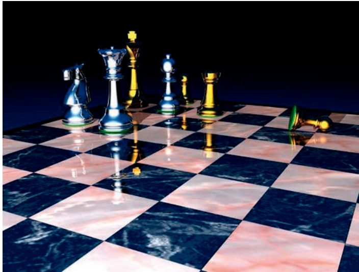
Image 1. Checkmate